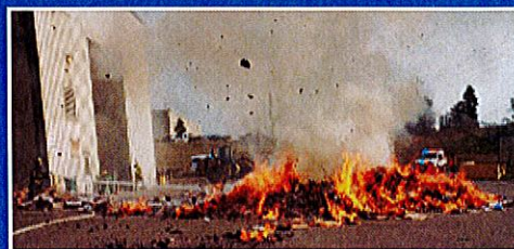
Firefighter extinguishing a lithium battery fire after the combusted pile of recyclables was moved outside by a municipal recycling facility operator.