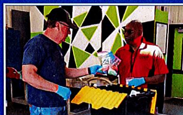
A customer carefully disposing of multiple e-cigarettes at an HHW collection site.